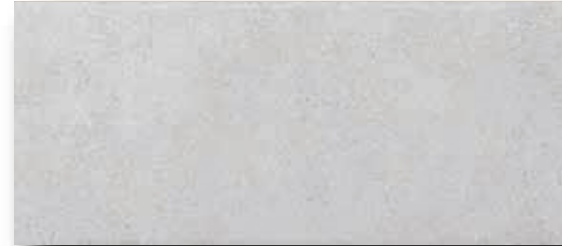
Main bathroom pavement