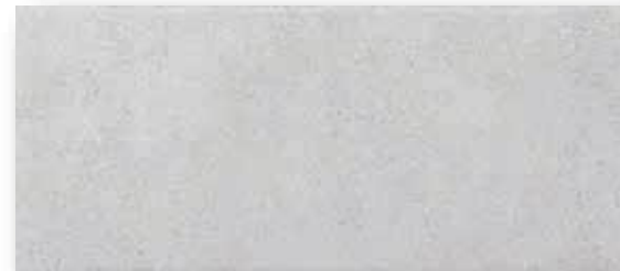
Hall's bathroom pavement