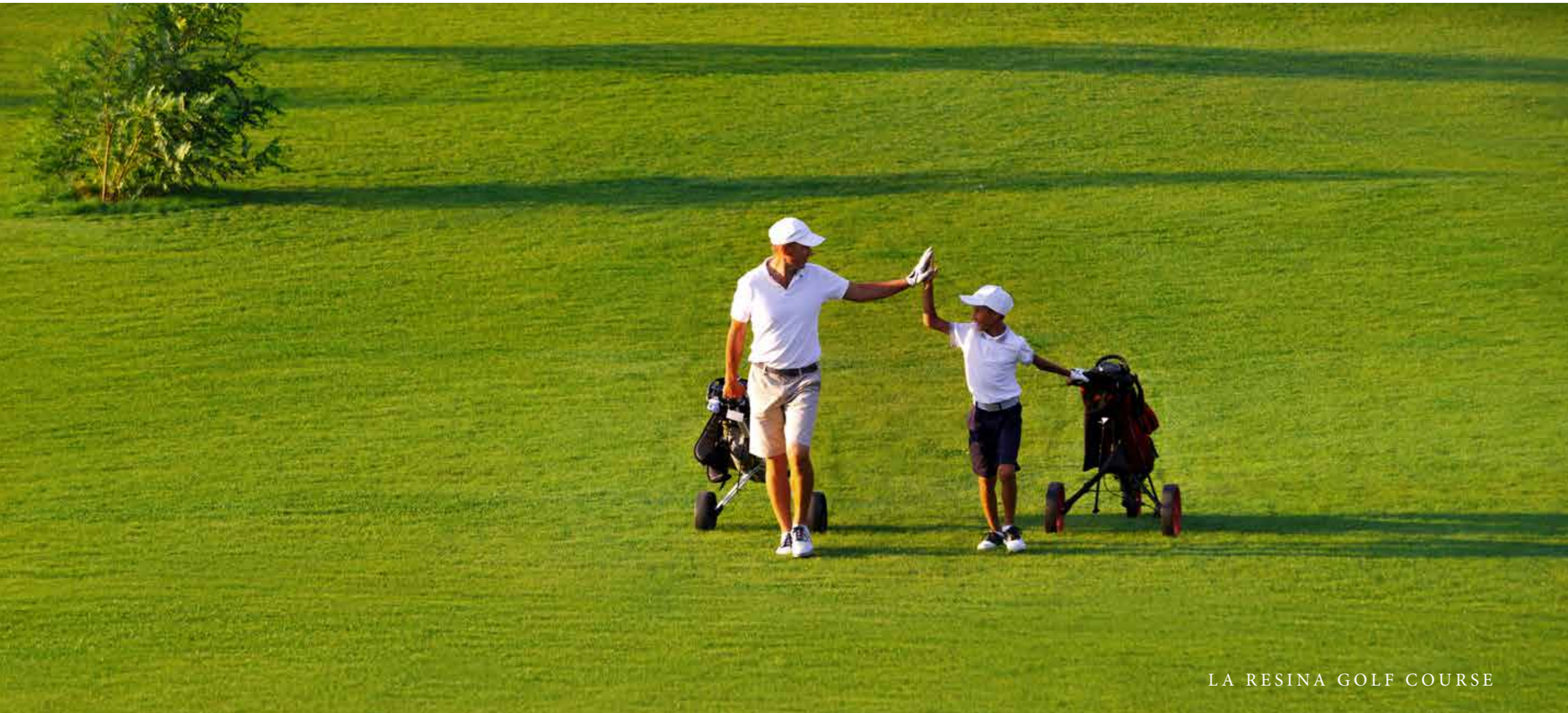
LA RESINA GOLF COURSE