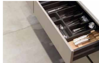
Etimoe Ice – Gris Hook Mate (Porcelanosa) Kitchen design