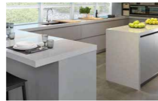
WIND MATE – EUCALYPTUS (Porcelanosa) Option for island (Silestone White)