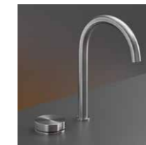
Plumb GIO21 (CEA)