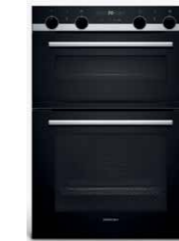
iQ500 Built-in double Stainless-steel oven