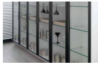
R4.70 Blanco Sal (Porcelanosa) Gallery for kitchen