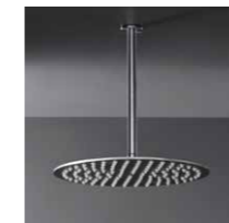
Rain shower head (CEA) FRE40