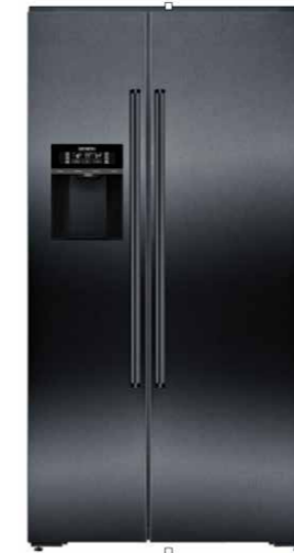
Fridge - iQ700 American fridge 177.8 x 91.2 cm Black stainless Steel