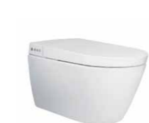
I-Comfort (Porcelanosa) WC