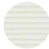
Museum Decor white 30x90 (Newker) Feature shower wall guest bathroom 1 and 2.