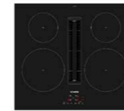
iQ300 Induction hob with integrated ventilation system 80 cm