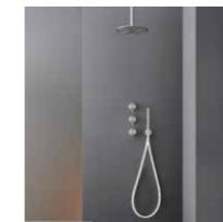
Shower hose (CEA) MIL90