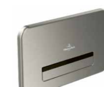
Installation system (Porcelanosa) Stainless Steel