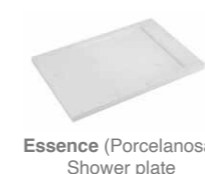
Essence (Porcelanosa) Shower plate